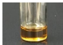
【Fig. 1 : sample】

* Safety Data Sheet information: contains mineral oil, polyolefin amide alkene amine and Molybdic acid special mixed amine salt.