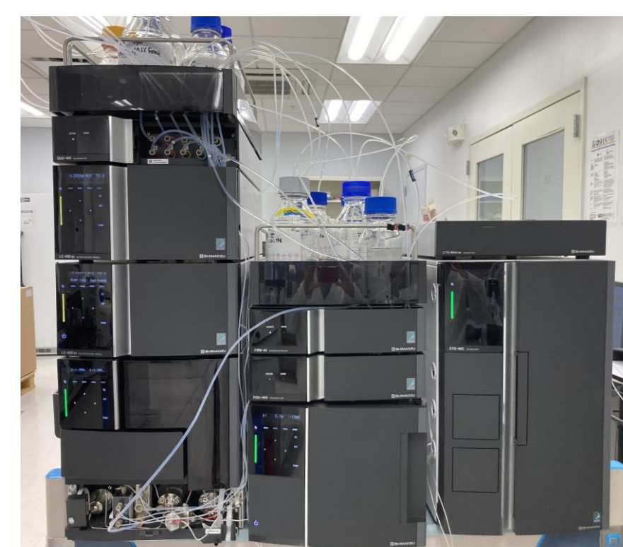
Fig. 2. Nexera Mikros trap and elute LC system with additional loading pump rinsing functionality.

Two common GLP-1 analogs, semaglutide and liraglutide, were purchased through Caymen chemicals. Standards were dissolved and further diluted in 6% acetic acid solutions. The analysis was performed on a microflow LC system with trap-and-elute configuration ( Figure 2 ) coupled with a triple-quadrupole LC-MS/MS system. A Newomics DuoESI source with a M3 emitter was used as the microflow ionization source. Source parameters, such as probe position, voltages, gas flow, and temperatures were optimized to maximize sensitivity. Method details are summarized in Table 1 .