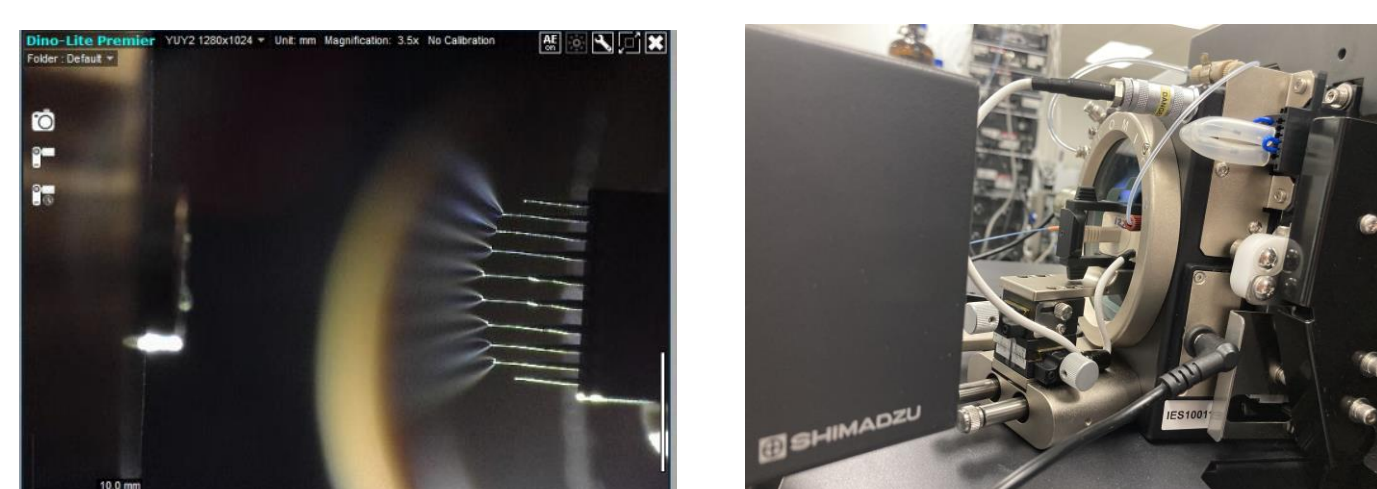
Fig. 1. The Newomics M3 Multi-Nozzle Emitter (left) and the Newomics Source mounted on the Shimadzu LCMS (right).

A multiple spray electrospray ionization (ESI) allows increased sensitivity by enhanced ionization efficiency through multi-nozzle emitter instead of the traditional single-nozzle emitter, Figure 1 .